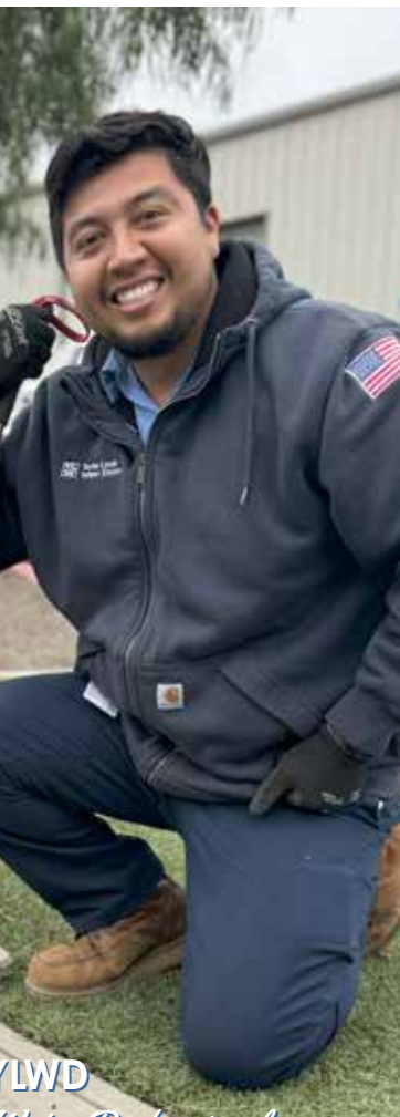
YLWD Water Professional